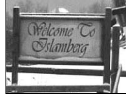
Sign posted in front of Hancock, NY commune