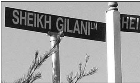
Street sign near Red House, VA commune

For example, in November 2003, two suspected