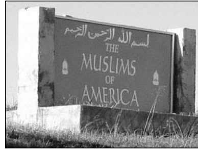
Sign posted in front of the Red House, VA commune

During the investigation, it was noticed that Gateway used inflated attendance numbers to receive additional funding from the state of California. This fraudulent inflation produced an extra $3 million in funding for Jamaat ul-Fuqra.