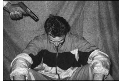
Daniel Pearl at the hand of his captor

The convicted bomber who tried to kill American nationals at a U.S. embassy in Africa in 1998 and the convicted “shoe-bomber” who attempted to destroy a passenger airliner in December 2001,