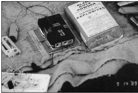
Explosives found in storage unit

Also, a detailed description of a firebombing attack was found. Law enforcement believes it was the plans for an attack on the Hare Krishna Temple in Denver that occurred five years prior. After investigating, law enforcement discovered the 1984